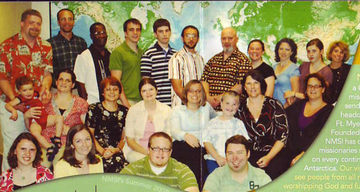
NMSI's Summer 2008 missionary training group

NMSI is a Christian missionary sending agency headquartered in Ft. Myers, Florida. Founded in 1989, NMSI has over 200 missionaries serving on every continent but Antarctica. Our vision is to see people from all nations worshipping God and fulfilling their God-given purpose.